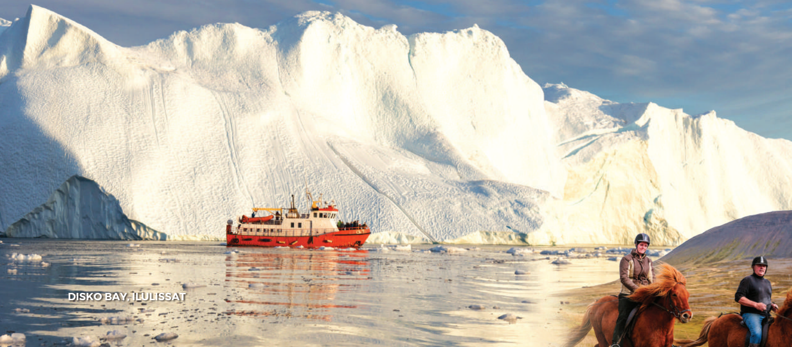
DISKO BAY, ILULISSAT